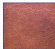
Apply Color Adjuster