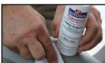
Apply Mohawk Leather Protector