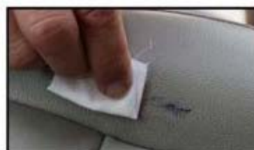
Wipe with clean cloth