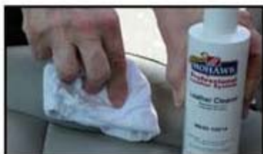
Clean Ink Remover and residue with Mohawk Leather Cleaner