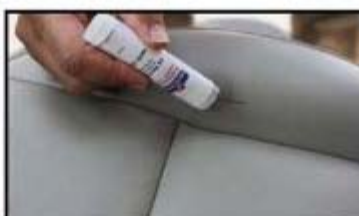
Apply Mohawk Ink Remover