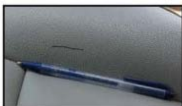
Ink stain on leather seat